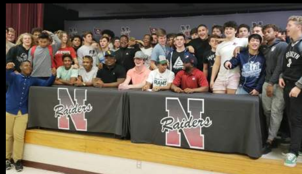
Outpouring of support from classmates and teammates.